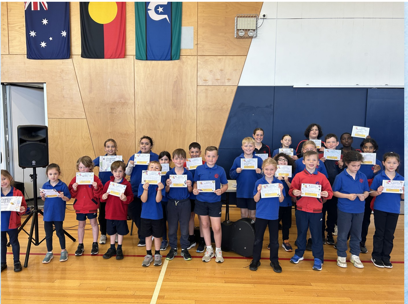
Our Term 3 Terrific Kids