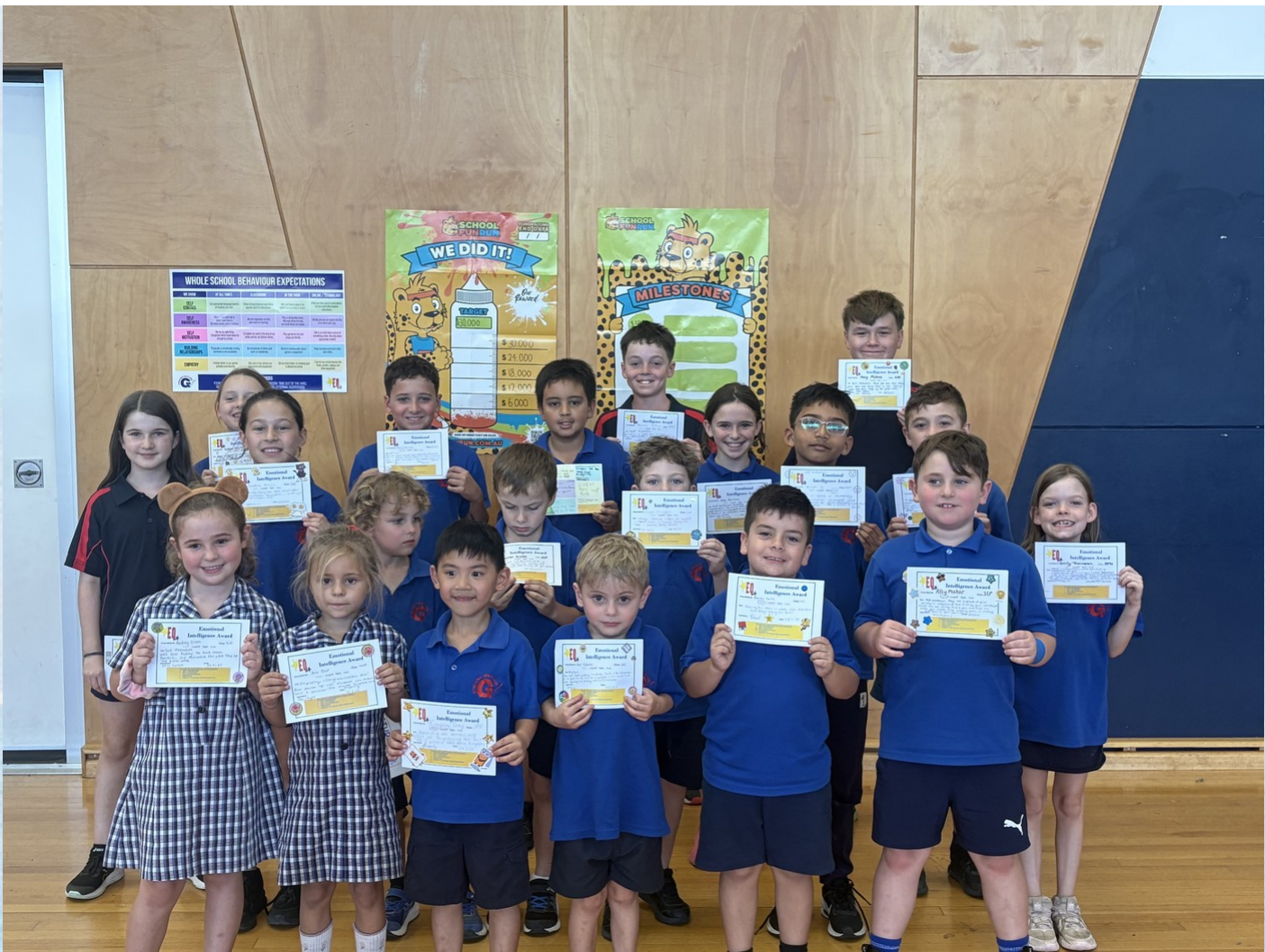
EQ Week 7 - 14th March 2025