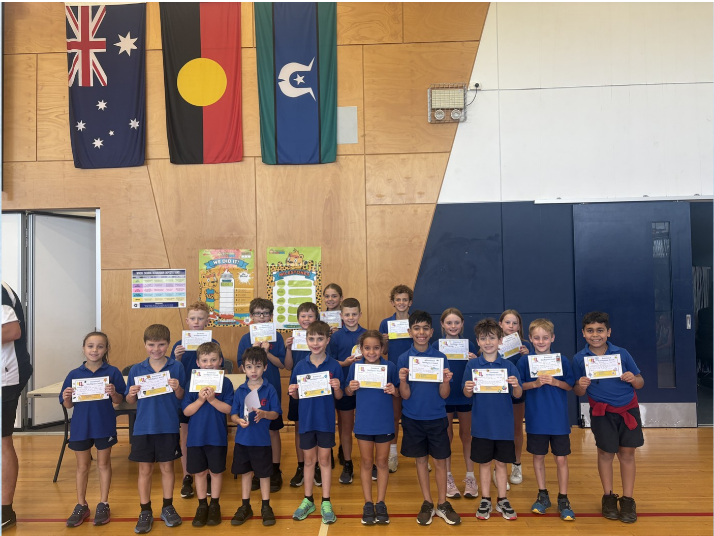
EQ Week 8 - 21st March 2025